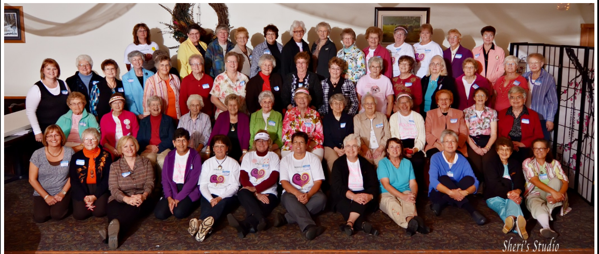
The Doris Club had 60 participants that enjoyed the Paynesville Historical Society and many of the other businesses in Paynesville on September 16th.